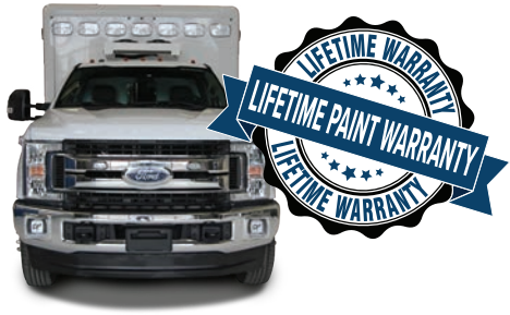
CrestCoat is a durable and cost effective corrosion prevention solution backed by a Lifetime Paint Warranty.