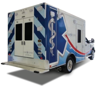
The all aluminum underbody bumper protects the module in low impact collisions.